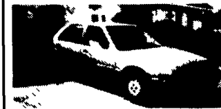
1988 Honda Accord 4 Dr., 5 Spd., Air, AM-FM Cass., 79K Miles, Runs Good, Blue. $5,450 Choice Of 2

WANTED: Good Late Model Construction Equipment Need S/N And Price When You Call