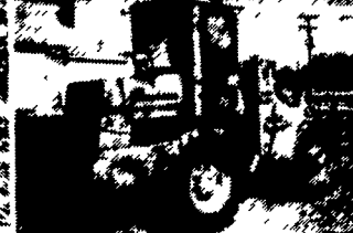
1977 Flat 345B Wheel Loader With Forks, Diesel, Articulated. $9,500