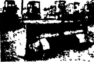
Tow Behind Cinder Spreader, I Have 2. Each $1,000