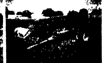
Miller 14' Offset Disc, Good Condition. $3,900

WANTED: Good Late Model Construction Equipment Need S/N And Price When You Call