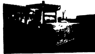
Advance 5600D Sweeper-Diesel, Hi Dump, Cab, Hydrostatic, Runs Good. $5,900