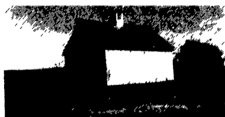
Use on Barns Or Garages