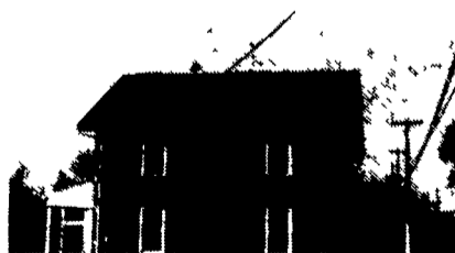
Beautifies All Homes Old & New