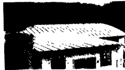
Good For All Roof Angles