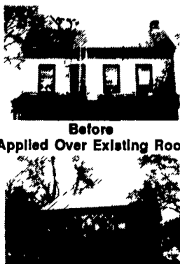
Before Applied Over Existing Roof