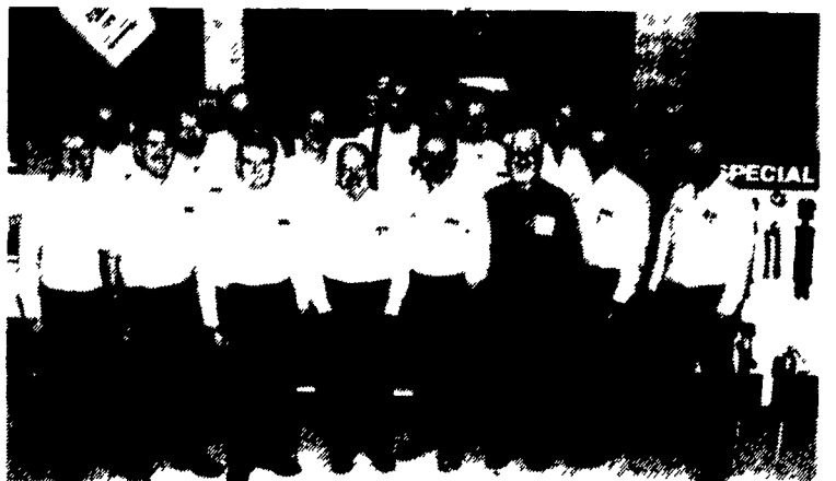
Hooper's Professional Partsmen... Have Parts In Stock!!!