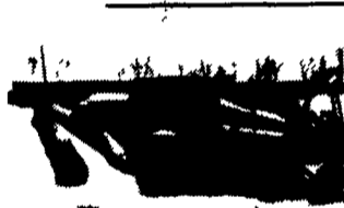
'90 Ford 555C TLB w/Full Cab, 4WD Ex-Hoe, Excellent Cond. $30,000

RT. 72N, Manheim, PA. 717-664-2444 717-665-2354 FAX 717-664-2835 NEW & USED Farm & Construction Equip.