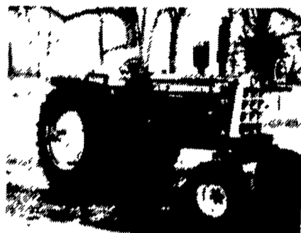
Oliver 1955, 4400 hours, excellent condition.....$6,500

Kverneland 7500 Harrow Demo Model SOLD Less Than 700 Hours $5,000 Welger Balers, Corry Roll Off Wrappers, Sunfilm Stretch Wrap, Clover Twine, White 6 Mil. Silage Covers, Special Repair Tape