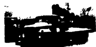
National 4T46 Truck Crane w/Front & Rear Stab. Mounted on Ford F-800 Truck $14,500