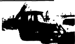
'90 Case 580K TLB w/Full Cab Ex-Hoe 4 WD, VG Cond. $34,500