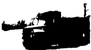
'72 Ford L8000 Dump Truck w/3208 Cat Diesel, 5 Spd. Trans., 2 Sp. Rear $10,500