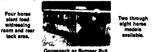
Four horse slant load dressing room and rear tack area. Gooseneck or Bumper Pull. Two through eight horse models available. Two horse with 5 ft. dressing room. 4 Horse Stock Trailer.

All Trailers Include • Full under coating • Rust preventive primer • Automotive grade acrylic paint • 2" treated, #1 grade wood floors • Complete trailer steam cleaned with acid solution • All seams and joints totally sealed - inside and outside.