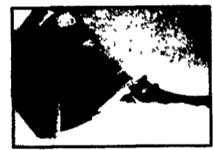
Typical Building Casualty