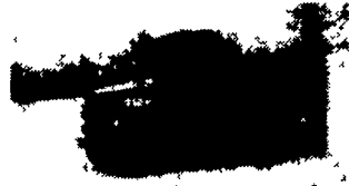
'72 Ford L8000 Dump Truck w/3208 Cat Diesel, 5 Spd. Trans., 2 Sp. Rear $10,500

Eager Beaver 20 ton tag-a-long trailer, air brakes ..... $6,500 1978 IH S2250 w/290 Cummins, 10-Spd. Trans., Tandem Axle Truck Tractor ..... $6,500 1975 Ford L9000 Tandem Axle Dump Truck, Cummins Dsl., 10-Spd. Trans. .... $12,500 1972 Ford L8000 Single Axle Dump Truck w/3208 Cat Dsl., 5-Spd. Trans. w/2-Spd. Rear ..... $10,500 National 4T46 Truck Crane Mounted On Ford F800 Truck ..... $14,500