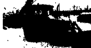
'88 Case 580K TLB w/Full Cab Ex-Hoe 4 WD, VG Cond. $30,000