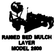
RAINED BED MULCH LAYER MODEL 2800

FREE 1994 CATALOG EQUIPMENT MFG. BY RAIN-FLO IRR.