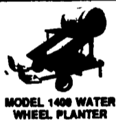
MODEL 1400 WATER WHEEL PLANTER

MOST ITEMS IN STOCK FOR IMMEDIATE DELIVERY DISCOUNTS ON QUANTITY ORDERS WE SHIP UPS DAILY LARGER ORDERS SHIPPED MOTOR FREIGHT