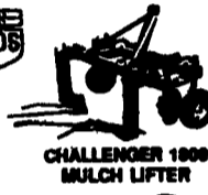
CHALLENGER 1800 MULCH LIFTER