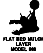
FLAT BED MULCH LAYER MODEL 680

FREE 1994 CATALOG EQUIPMENT MFG. BY RAIN-FLO IRR.