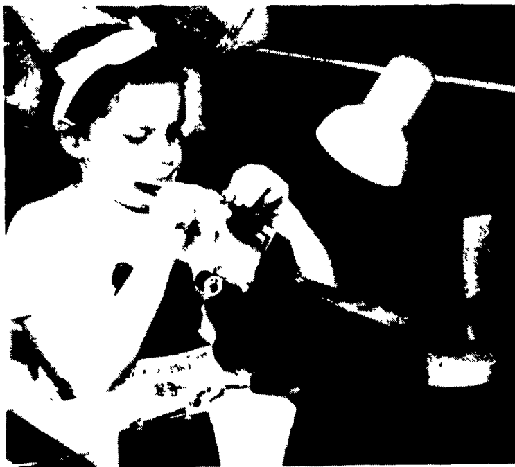
Youngsters can get hands-on training for many outdoor activities on Youth Day, Monday, February 7.