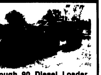
Hough 90 Diesel Loader, Runs But Needs Some Work. $3,500