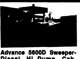
Advance 5600D Sweeper-Diesel, HI Dump, Cab, Hydrostatic, Runs Good. $5,900