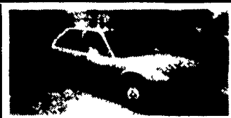
1988 Honda Accord 4 Dr., 5 Spd., Air, AM-FM Cass., 79K Miles, Runs Good, Blue. $5,450 Choice Of 2

WANTED: Good Late Model Construction Equipment Need S/N And Price When You Call