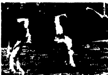
8H2085 Mascot +$258 MFP +2,198M +2.16 PTAT

New Sire: graduate of random sampling program with 70% REL or second summary; REL—reliability; MFP$—economic index including milk, fat, and protein; BL—carrier of Bovine Leukocyte Adhesion Deficiency (BLAD); EDBH—Expected Difficult Births in Heifers; P—prelim., less than 70% REL; Obs—no. calvings observed