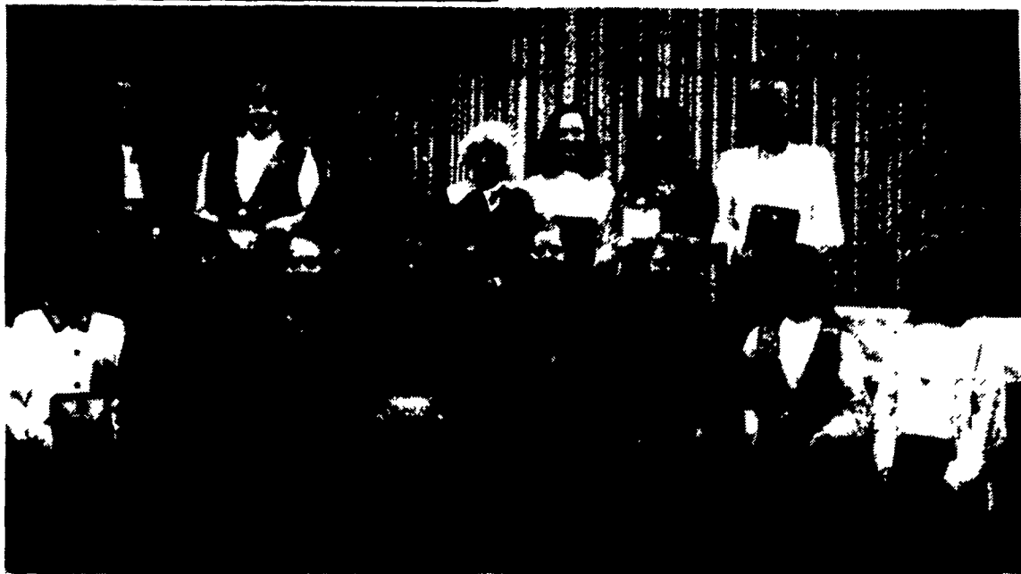
Lancaster County state winners were presented at the recent Horse Club Recognition Banquet.