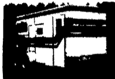
Two horse with 5 ft. dressing room