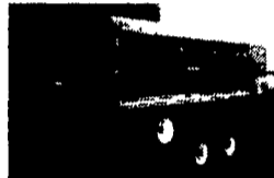
4 Horse Stock Trailer