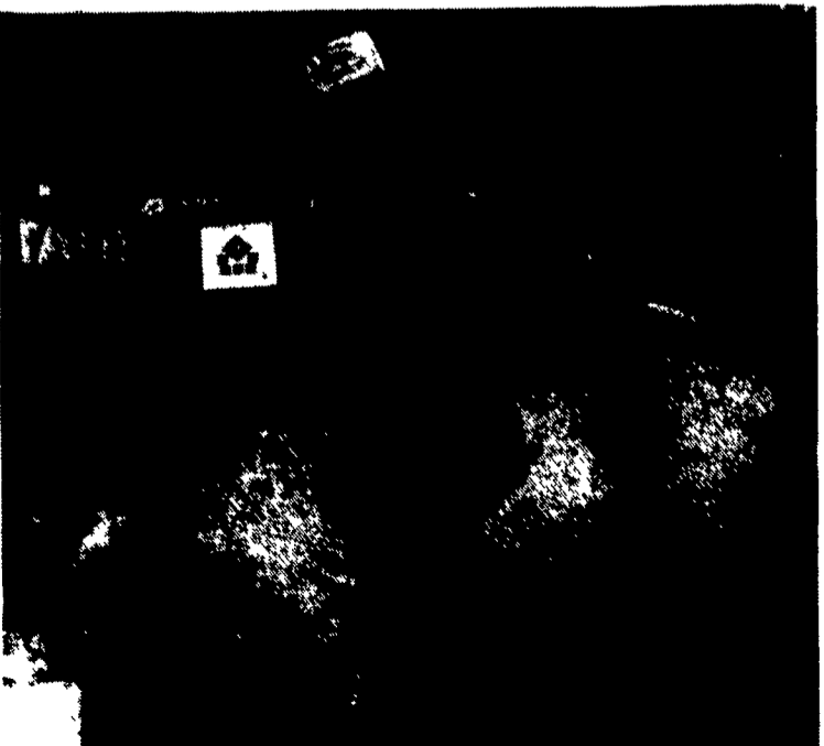
The champion Spotted swine was shown by Russell Kegg.