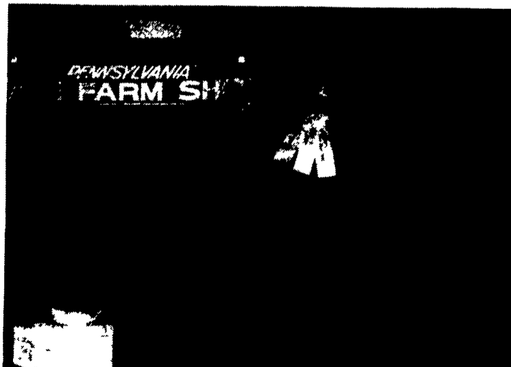
Duroc reserve champion gilt went to Clyde McConaughy, Smicksburg.