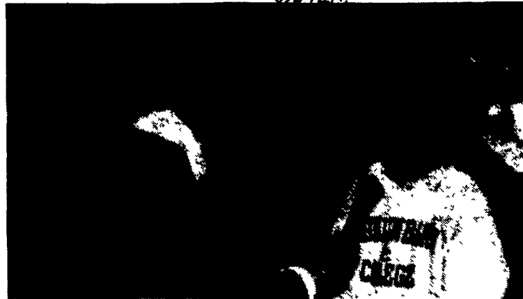
"Why didn't the skeleton cross the street?" Timmy Ruderow asks the audience. The answer: He didn't have the guts to do it.