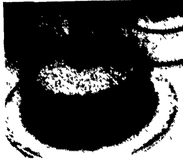
First prize cake is Hershey Chocolate Almond Cake.