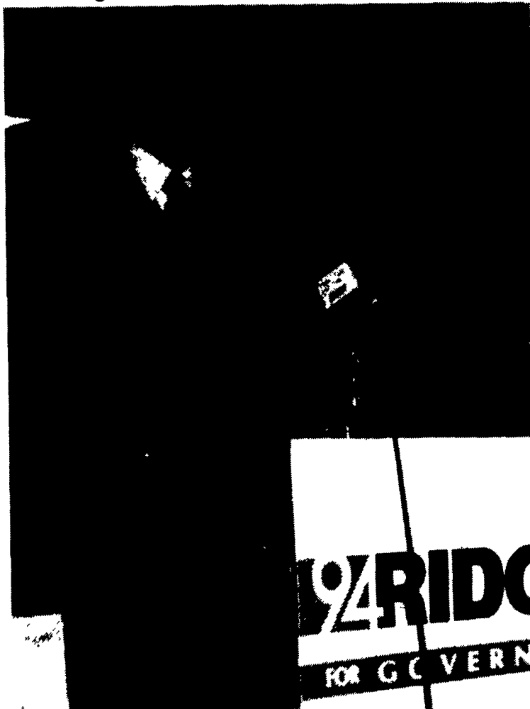
Tom Ridge at the Farm Show news conference.

In addition, "A Plan for Pennsylvania Agriculture" calls for bolstering the efforts of the Department of Agriculture to