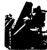
(10) HIAS; IMTCO, National, Etc Knucklebooms Unmounted Or Mounted $4,500 And Up