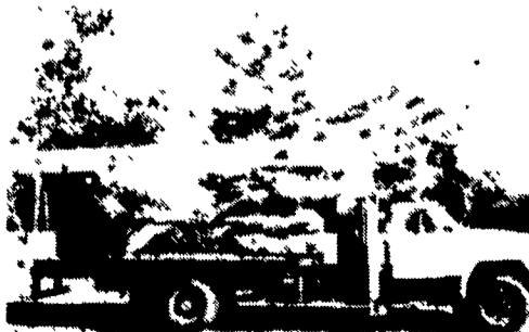
(3) MANITEX Model 1461 14-Ton Cranes; 71' Hoc Height; Mounted on 1980 Ford; 1991 Ford; 1991 Int'l Diesel Tractors .....$54,000 to $58,000 (1) 1967 FORD Diesel Tractor with MANITEX 11-Tc Cap.; 71'+40'=111' Hook Height .....$44,500