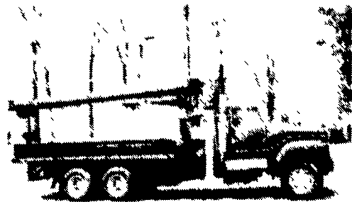
1981 Int'l F2554; DT466; 13 Spd.; w/R.O. 150-2 15 Ton Crane; 80' Boom +23' Jib = 103' Hook Height.