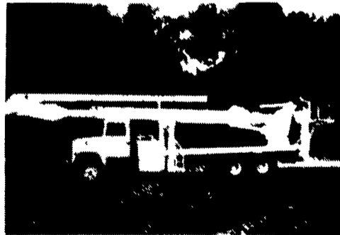
1979 FORD LNT9000; 230 Cummins; With Reach-All 100' Bucket Truck; 34,000 Miles .....$59,500