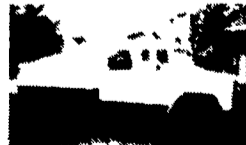
1981 Int'l 81824 Crew Cab, V8 Auto, 24,000# GVW, No CDL Needed Nice $8,900