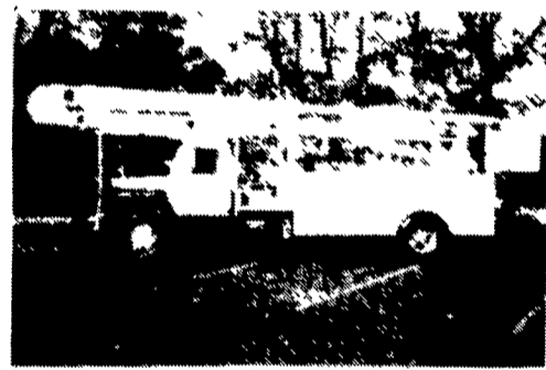
1980 International; 3208 CAT Diesel; 5 Spd.-2 Spd. With Hi-Ranger 65' Bucket .....$42,500