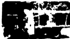
MACK Cabover Diesel Tractor With Pitman 5-Ton Crane, 41' Hook Height $9,800