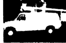
(18) 1984 To 1990 One Ton Bucket Vans, Utilities -Verallift, Teletac's, Etc $8,500 & Up

OPDYKE INC. (215) 721-4444 Truck & Equipment Sales 3123 Bethlehem Pike Hatfield, PA 19440 (Phila Area)