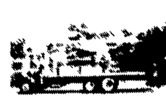
1979 Mack M685 w/Prentice HTSR Sheet Rock Loader $18,500