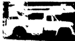
(38) Bucket Trucks: 36', 40', 42', 45', 48', 50', 55', 65' In Stock (Call For Specs & Prices