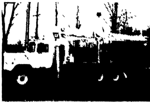
1989 Mack DM690S; 300 H.P.; 6 Spd.; w/R.O. 175-73 Crane; 16 Ton Cap.; 85'+37' Jib = 122' Hook Height .....$89,500