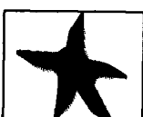
Standard Bolt-On Tines