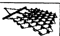
Optional Chain Harrows