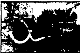
With the accessory 8" Applicator Hose w/Adapter you can dispense material drawn from the trailer or other container with the standard 8" hose. Ideal for mulching or transferring material.