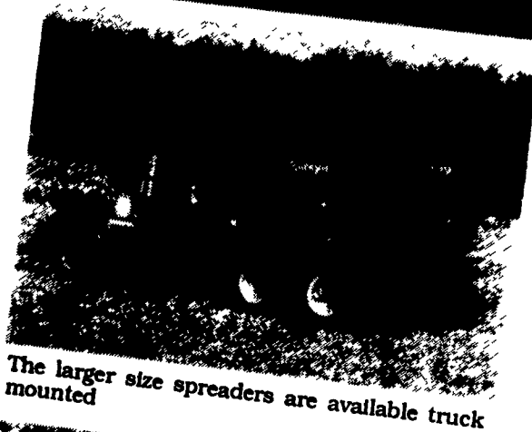
The larger size spreaders are available truck mounted