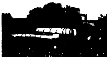
New 6600 Planter two-bar design features interplant row units

and wide array of attachments allow you to plant in nearly any field condition—no-till, mulch till, or finely worked—with row widths ranging from 15" to 40".