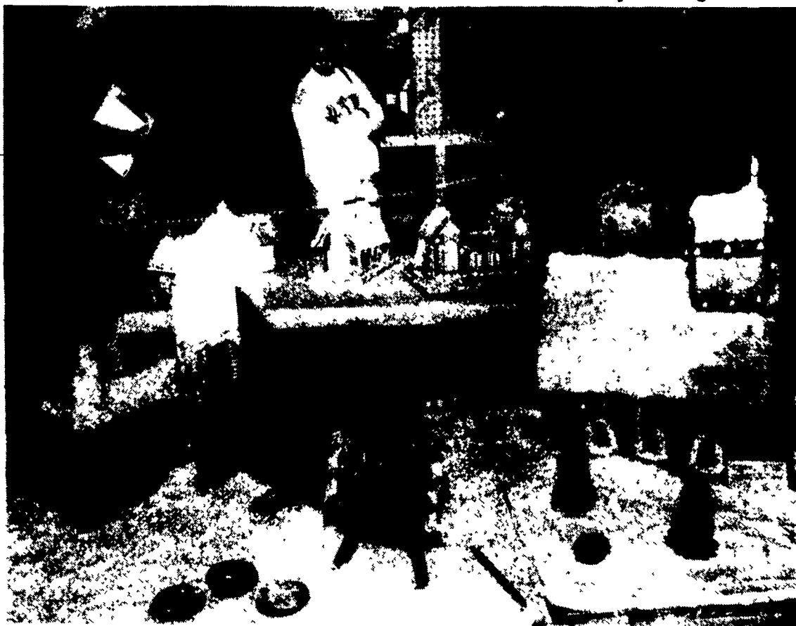
Some gingerbread, an assortment of candy and a lot of imagination and time is all it takes to create fanciful gingerbread houses.