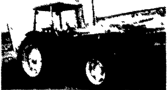
JD 3150 4x4 Hi-Lo 1540 Hrs. $21,500.00