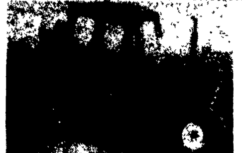
Ford 4600 Cab, Diesel $4,000

403 Centerville Rd., Newville, PA 17241 (717) 776-6242 No Sunday Calls No Out-Of-State Personal Checks We Ship UPS