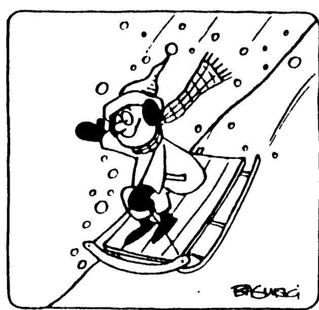
A little money buys a lot of Action. USE CLASSIFIED ADS

* Registered trademark of Raiston Purina Company