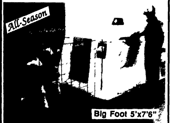
Big Foot 5'x7'6"

The Poly Square Big Foot is constructed of Opaque material to eliminate the solar effect. It blocks out sunheat-not sunlight. Poly Square's inverted ribs and 5' (W)x7'6"(L) make it the biggest unit on the market today and extremely wind resistant. It has no pop rivets which means no breaks or cracks for snow and rain to sift in. The unit weighs 100 pounds plus manger & buckets. And Poly Square Big Foot is large enough so your calf can lay in the center, away from cold walls in the winter.