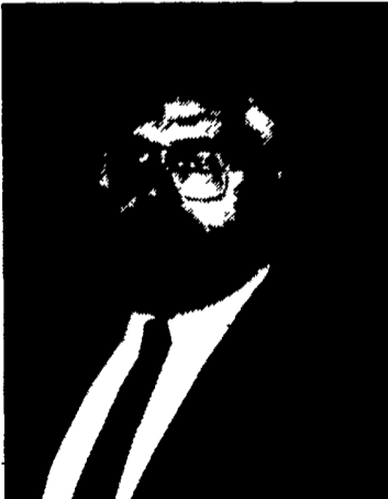
Director Of Nutrition F.M. Brown's Sons, Inc.