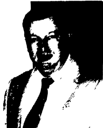
Sales Manager F.M. Brown's Sons, Inc.

SEE YOUR BROWN'S AREA DIRECTOR OF MARKETING AND NUTRITION FOR DETAILS AND RESERVATIONS