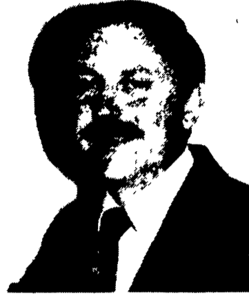
Dairy Herd Manager USDA Forage Res. Ctr. - Madison, WI