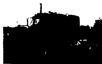
1987 KENWORTH, W900 Kit, NTC400, RTO14608LL, DS402, Air Ride Suspension.