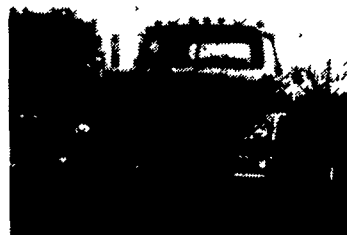
1984 GMC BRIGADIER 18,000 Lbs. Front Axle, 46,000 Lbs. Rear Axle, Tag, 6V92TA; 330 HP, 8LL Transmission.