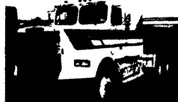
1987 FREIGHTLINER FLC 12064 40" Sleeper, FNTC315 RT12609A SQ-100, 40,000 Air Ride Suspension.