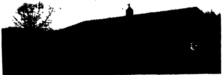
60x104 w/30' Stable Area