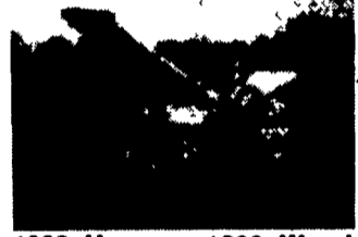
1988 Vermeer 1200 Wood Chipper, 1661 Hours, Ford Gas, Runs Good. $6,900