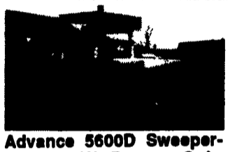
Advance 5600D Sweeper-Diesel, Hi Dump, Cab, Hydrostatic, Runs Good. $5,900