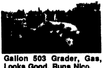
Gallon 503 Grader, Gas, Looks Good, Runs Nicc. $6,900