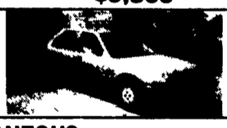
1988 Honda Accord 4 Dr., 5 Spd., Air, AM-FM Cass., 75K Miles, New Inspection, Runs Good, Blue. $5,450

WANTED: JD 510 Backhoes 1980 & Up JD 710B Backhoes, All Kinds - John Deere, Case, Cat Construction Equipment