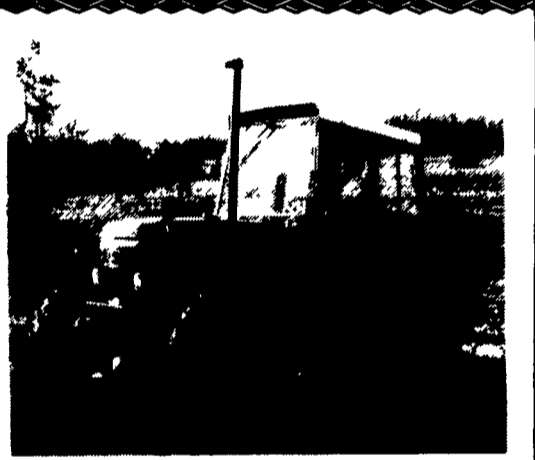
JD 2140 4x4, 70 HP, 540 & 1000 PTO, Hi-Low $9,000