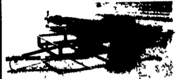
4x6, 5x10, 6x12 UTILITY TRAILERS STARTING AT $499