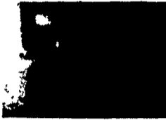
ALL TRAILERS BUILT "IN OUR SHOP"