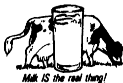
Milk IS the real thing!

FREY BROS. INC. 372 Puseyville Road Quarryville, PA 17566