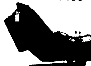
Model 3200 Hydraulic Bale Thrower