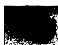
Model M22 Hog Two-Drink Part No. 16278 31" x 20" x 8" Capacity: 80 hogs

Electric-free fountains that live up to the Ritchie® name.