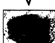
Model C78 Cattle Four-Drink Part No. 16290 42" x 35" x 18" Capacity: 200 cattle