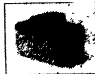
Model C77 Cattle One-Drink Part No. 16271 28" x 24" x 18" Capacity: 100 cattle