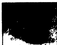
Model C71 Cattle One-Drink Part No. 16271 28" x 20" x 18" Capacity: 50 cattle