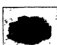
Model M24 Hog Four-Drink Part No. 16280 31" x 31" x 8" Capacity: 160 hogs