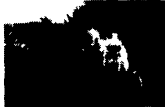
Miniature Sicilian Donkeys

Quality Registered Animals All colors Spotted Stud Available