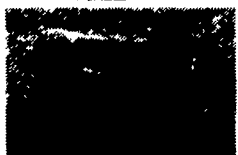
Scotch Highland Cattle

Quality Registered Animals All colors Spotted Stud Available