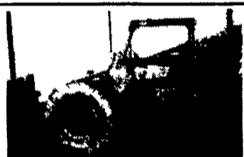
Gehl DM54 4 Wheel Drive Forklift With Ford Diesel In Nice Condition