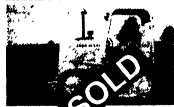
JD 450E 3-Way Blade, Excellent Condition $22,000