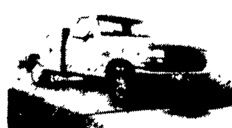
1993 F-350 4x2 Utility Truck, 5.8L EFI, V8, Elec. 4 Spd., Auto, 3.55 Regular Axle, 133 Inch Wheelbase, Super Engine Cooling, HD Battery, Bright Red w/Dk. Charcoal Interior. Stock #3275.