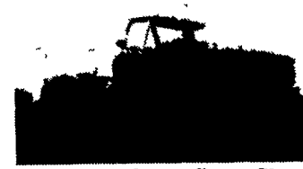
1994 F-450 Super Duty Chassis Cab, XL, 7.3L Diesel, 5 Spd. Manual w/OD, 5.13 Regular Rear Axle, Dark Blue w/Royal Blue Interior Stock #5945.