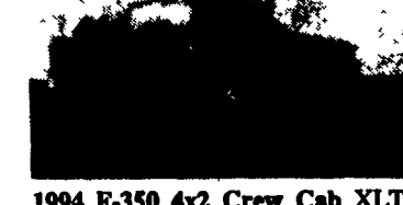
1994 F-350 4x2 Crew Cab XLT, 7.3 L Diesel, V8, Elec. 4 Spd., Automatic, 4.10 Rear Axle, Camper Package, AC, Speed Control, Tilt Steering Wheel, Power Door Locks/Windows, Green w/Grey Interior Stock #7825.