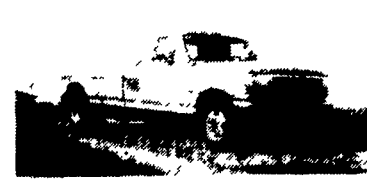
1994 F-350 SC 4x3, 7.3L Turbo Diesel, Elec. 4 Spd., Auto, XLT, 4.10 Limited Slip Rear Axle, Camper Package, Speed Control, Tilt Steering Wheel, Power Doors, Power Locks, Tucson Bronze w/Mocha Interior Stock #4520.