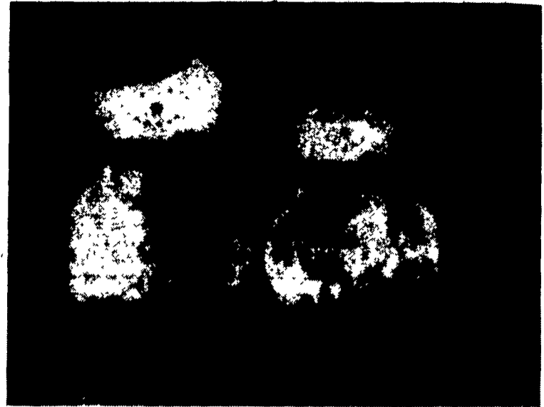
These delightful snowmen can be made with the instructions and patterns that appear with this article.

Paint snowman with two coats white paint. Let dry between coats. Apply antiquing medium to snowman. Leave on for 5 minutes then wipe off with cloth.