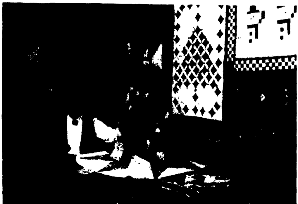
Members of the Berks Quilter's Guild display projects that members learn to do during monthly meetings.

Materials for small snowman: 2x6x8-inch pine board 1x1x1-inch block for hat 1/4 -inch piece of 1/4 -inch dowel for nose 1-inch piece of 1/4 -inch dowel for hat 6x9-inch piece black felt 1x16-inch piece plaid wool for scarf 2 7/32x1 1/4 -inch wooden axil pins for buttons