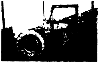
Gehl DM54 4 Wheel Drive Forklift With Ford Diesel In Nice Condition