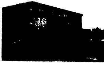
1987 Kawasaki 3800 Hr. In Excellent Condition