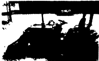
Kubota B1550 w/Loader & Belly Mower, Only 400 Hrs.