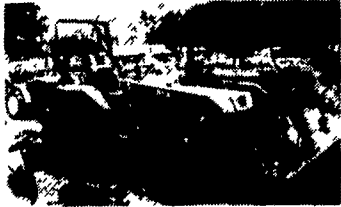
Kubota L2250 4x4 w/New Dual Loader, Very Sharp

We Have A LARGE SELECTION of 4x4 Compact Diesels w/Loaders For Sale, Rent or Lease!