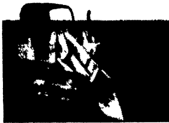
JD 350C Rebuilt Motor, new tracks, good UC $13,000