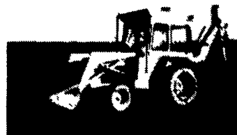
JD 310A, Excellent $10,500

WE ARE BUYERS FOR CONSTRUCTION EQUIPMENT NEEDING REPAIRS