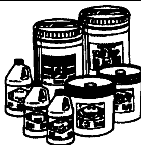
Milkhouse Sanitation Products