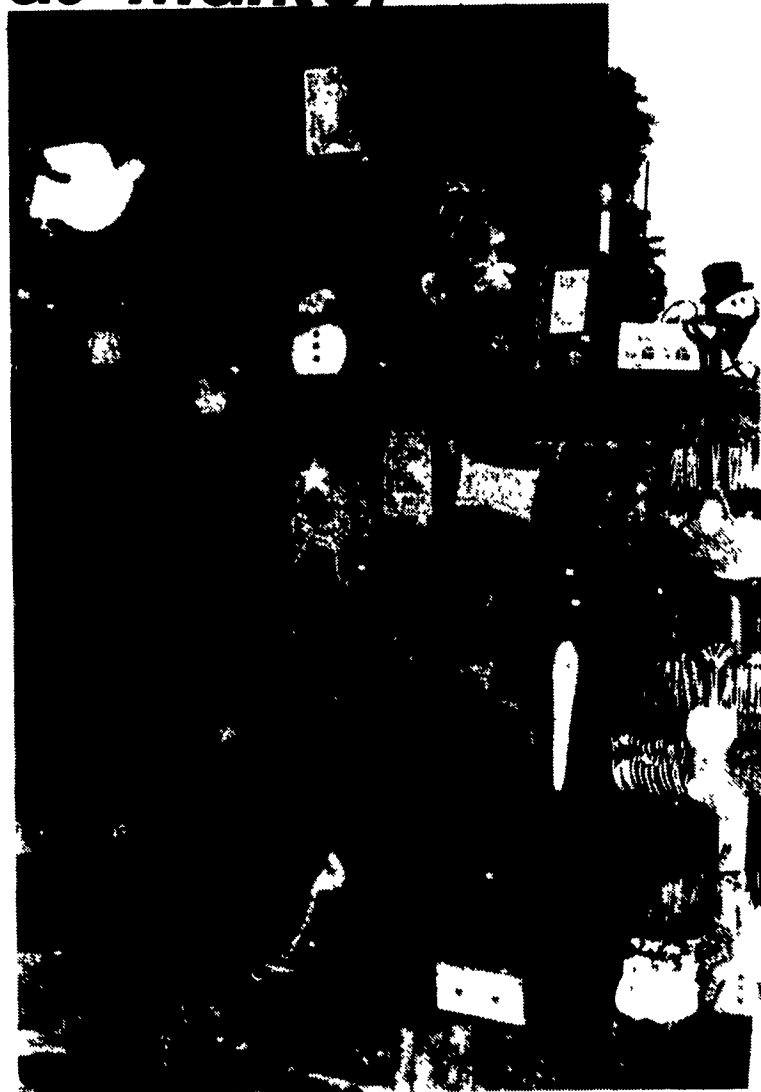
Christmasy country crafts blend well in an 18th century stone farm house on Harmony Springs Farm in New Berlin. Fraktur Folk Art verses, painted Santa bricks, wooden Christmas tree cutouts, "Welcome Friends" brick door stop, stenciled gift bags, and stuffed and antiqued "Seasons Greetings" pillows line the long wall facing a huge fireplace.