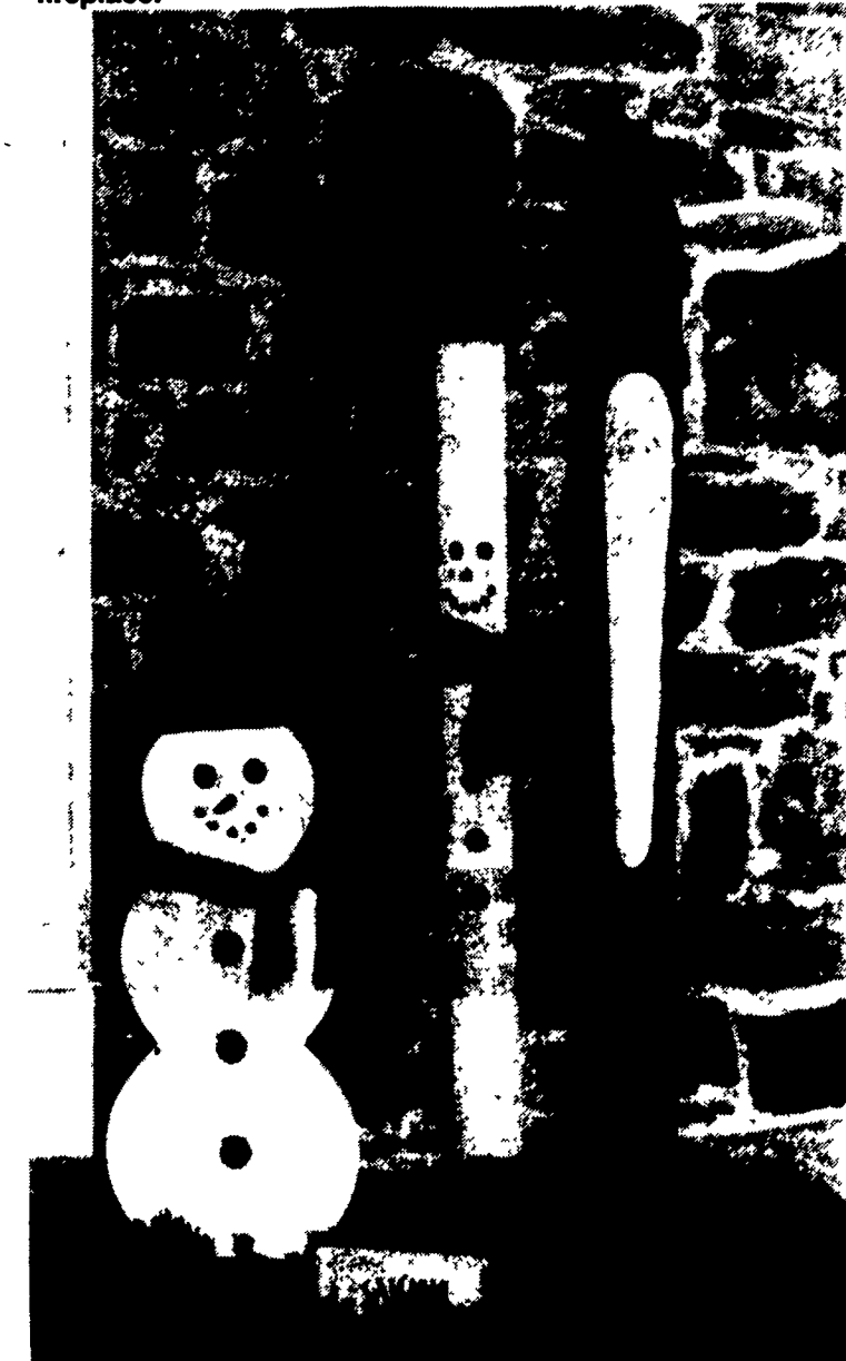
Fence post soldiers, snowmen, and santas stand to welcome visitors to the Christmas Market in New Berlin.