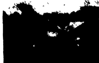
1988 Vermeer 1200 Wood Chipper, 1661 Hours, Ford Gas, Runs Good. $6,900