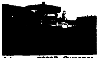
Advance 5600D Sweeper-Diesel, Hi Dump, Cab, Hydrostatic, Runs Good. $5,900