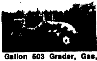
Gallon 503 Grader, Gas, Looks Good, Runs Nicp. $6,900