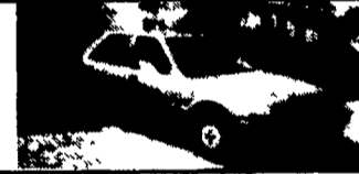
1988 Honda Accord 4 Dr., 5 Spd., Air, AM-FM Cass., 75K Miles, New Inspection, Runs Good, Blue. $5,600

WANTED: JD 510 Backhoes - 1980 & Up JD 710B Backhoes, All Kinds - John Deere, Case, Cat Construction Equipment