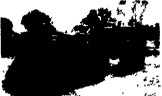
Hough 90 Diesel Loader, Runs But Needs Some Work. $3,500