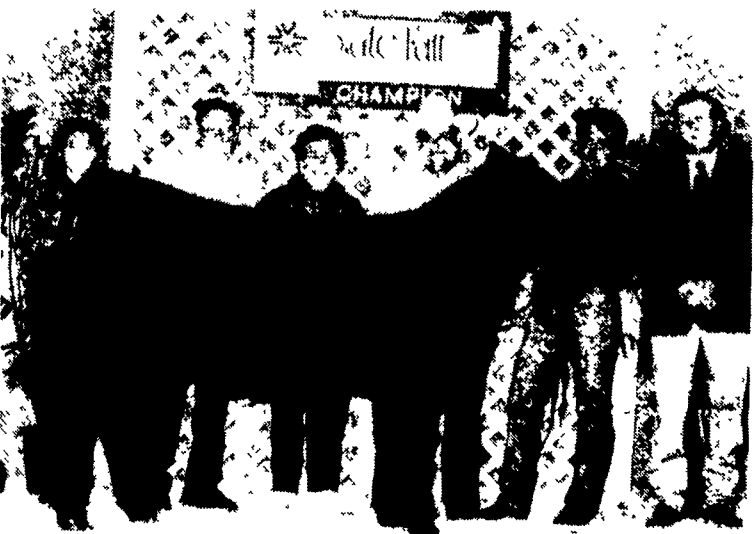
Whitestone Farm, Aldie, Va., displayed this grand champion female at the 1993 Virginia State Fair Angus Show in Richmond. The entry first won the heifer calf division and is an October 1992 daughter of Ginger Hill Boss 150. The heifer is named Whitestone Miss Skymere 2175.