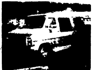
1987 CHEVY C20 CONVERSION VAN 350 Engine, AT, AC, Color TV, Cobra Conversion, CB Radio, 4 Capt. Chairs, 3rd Bench Seat, Raised Roof. $7,995