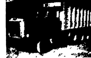
1974 AUTOCAR TRI-AXLE DUMP, 350 Cummins Engine, 13 Spd., 20,000 Front Axle, 48,000 Rear Axle, 18 Ft. Alum. Dump Body. $14,900