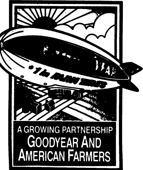
Lancaster Farming, Saturday, November 6, 1993-C1