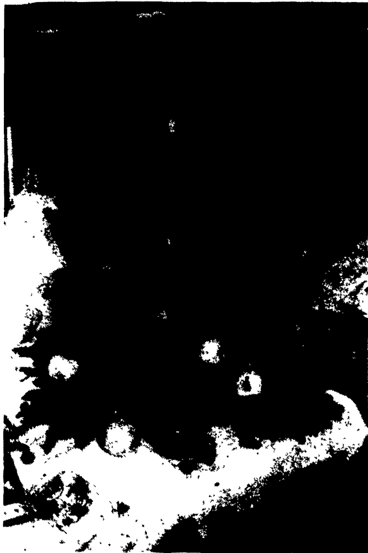
A tabletop tree, made out of leftover greens stuck into a frame made from a wooden dowl and a sheet metal strip, is decorated with fresh fruit.