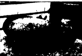
Model CT1 Cattle One-Drink Part No. 16271 28" x 20 1/2" x 19" Capacity 50 cattle

Electric-free fountains that live up to the Ritchie® name.