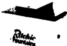
3 Cattle Fountain Designed for big service in small pens. Waters up to 100 head. Part No. 11295 17" x 28 1/2" x 28" high Electric (E30W CSA approved) or Gas

Recapping Your Ritchie® Fountains Makes Sense... And Saves Money!