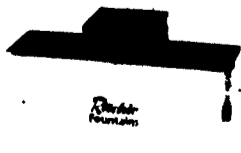
2AC Multi-Purpose Fountain Waters calves, sheep and goats. Perfect for horse stalls, small pens or feedlines. Waters up to 40 cattle/100 calves. Part No. 12295 10" x 24" x 18" high Electric (E30W CSA approved)